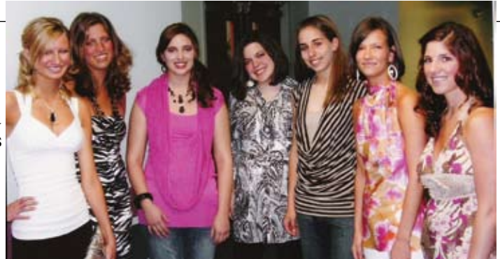
Peoria Notre Dame High School Anchors enjoyed being models for the day.