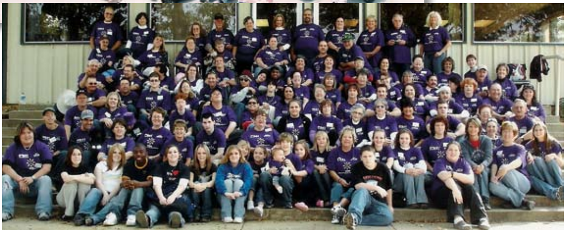
Circle of Friends

The Pilot Club of Marion (North Carolina) has been an ongoing supporter of Foothills Industries, a non-profit organization that employs adults with mental and physical disabilities. The club recently served dessert to residents of the facility. Residents appreciate the club’s visits and look forward to them.