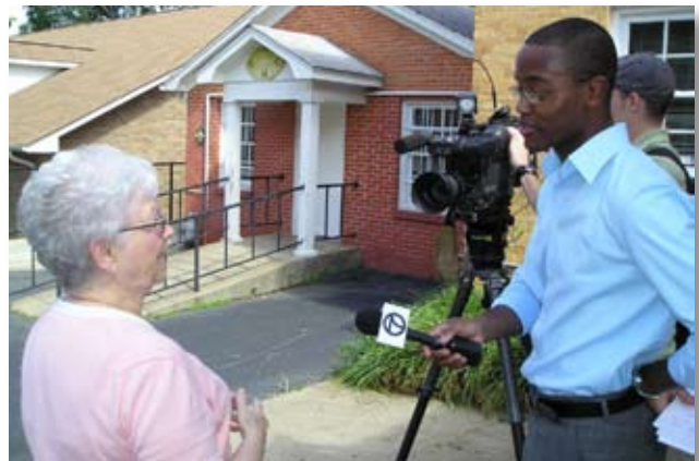
A fundraiser to purchase helmets generated a lot of publicity for the club.

The Pilot Club of Tyler (Texas) helped out with a recent Bike Rodeo, organized by the Tyler Police Department. At the rodeo they check bicycles for mechanical problems, make adjustments, fit free helmets for the kids, and teach them bicycle safety. The rodeo teaches that children should wear their helmets consistently to protect their brains, whether on bikes, skateboards, skates, "heelies" or other wheeled toys. The event was covered on the evening news by three of four local TV stations out there, and generated three articles in the local newspaper.