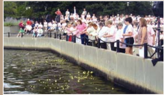
Attendees at the PI Memorial Service in Norfolk in July scattered rose petal on the water in memory of Pilots and Anchors lost this past year.