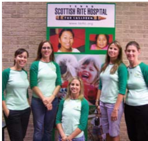
North Dallas Pilots brought the "Play Smart, Play Safe" message to Scottish Rite.

The Pilot Club of North Dallas (Texas) recently brightened the days of young patients at Texas Scottish Rite Hospital for Children by presenting the BrainMinder Buddies puppets, teaching them safety habits such as wearing seat belts and bike helmets to protect their brains. The club has also presented the BrainMinders program at daycare centers and schools, and plan to perform at Scottish Rite on a regular basis. They used the occasion to garner some publicity for their club with an article in the Dallas News, the local paper.