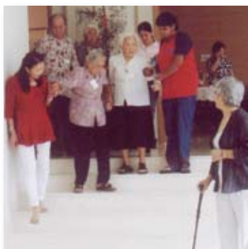
Pilots help Apex Lodge residents down the steps to see a show after lunch.