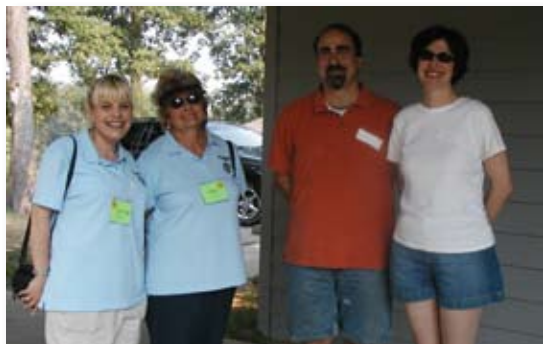
Club members went to camp in August.