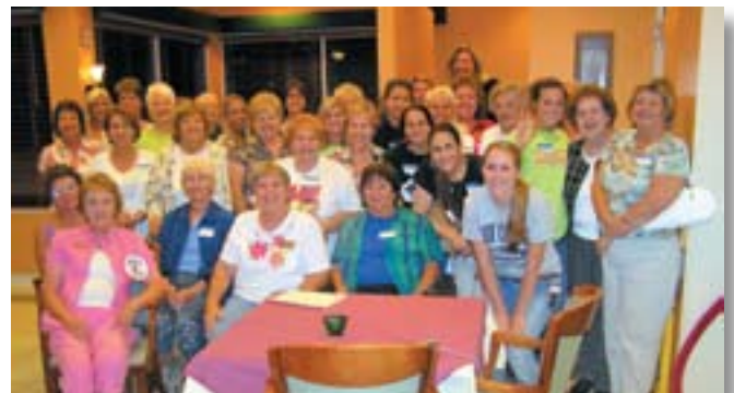
Pilots, Anchors and residents enjoy Bunco Night.

were instructed in applying and then testing the bracelets during regular maintenance. The Pilot Club supports the