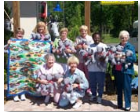
Rutherford Pilots recently visited Victory Junction Camp in Randleman.

The Pilot Club of Rutherford County (North Carolina) donated $1,000 and made mascot teddy bears and a quilt by hand for the campers at Victory Junction Camp, a year-round camp serving children ages 7 to 15 with a variety of health issues such as autism, burn survivors, cystic fibrosis, heart disease, and other physical disabilities. It enriches the lives of the children by providing life-changing camping experiences in a safe and medically sound environment.