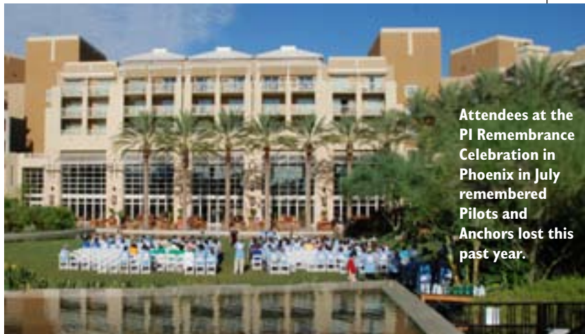
Attendees at the PI Remembrance Celebration in Phoenix in July remembered Pilots and Anchors lost this past year.